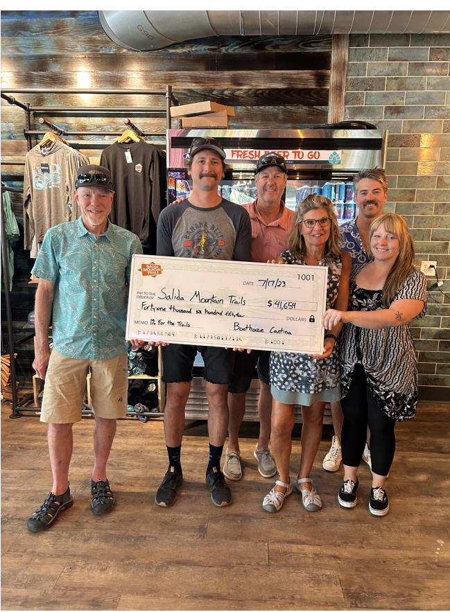
BIG CHECK PHOTO