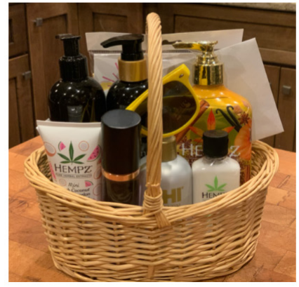
A SMALL SAMPLING OF AUCTION ITEMS AT THE 2022 MEMBER PARTY